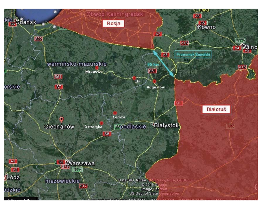
Fig. 3. Graphic illustration of the "Suwałki gap" (Rogacin 2015)

In view of the aggressive policy of the Russian Federation, the term "Suwalki gap" recently became popular, referring to the areas located around Suwalki, Augustow and Sejny, constituting a combination of the territory of the Baltic states with Poland and the rest of the NATO countries and those separating the territory of the Kaliningrad region and Belarus (Fig. 3) (Przesmyk suwalski in Wikipedia). Geographically, the area is a macroregion called the Lithuanian Lake District. However, from the point of view of military-geographical division of Polish territory, the "Suwalki gap" forms a section of the Masurian Region Operational component of the North-East Strategic Area.