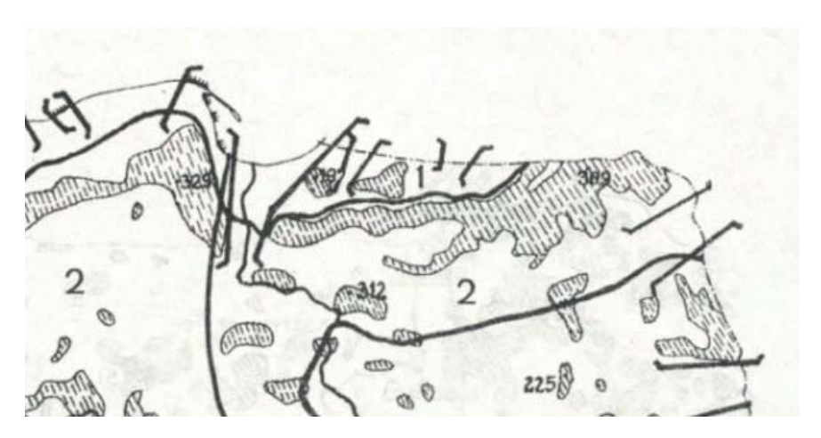
Fig. 4. Convenient directions for developing offensive activities in north-eastern Poland (Skrzyp 1993, p. 52)

The lack of natural terrain barriers on the Polish-Russian and Polish-Belarusian borders favours conducting offensive operations towards our country in two corridors, converging in the centre of Poland. Potential directions of activities from the territory of the Kaliningrad District and Belarus cover about 25% of the area of the Republic of Poland, along with Warsaw. This puts our country in an unfavourable position, which is somewhat altered by the neighborhood of Poland and Lithuania, which, as mentioned earlier, cuts the strategic space of Russia (Skrzyp and Lach 2008, p. 104).